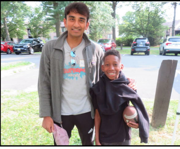
Bringing Role Models to Children in Mercer County Community Mentors