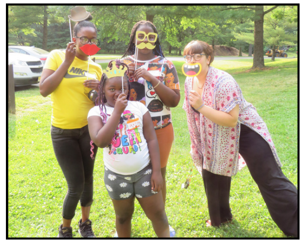
Little Moments, Big Smiles The Big Picnic

Thank you for your interest in sponsoring BBBS-Mercer.