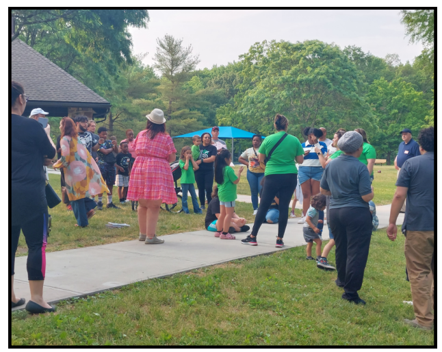
Bigs, Littles, Interested Volunteers and Staff The Big Picnic